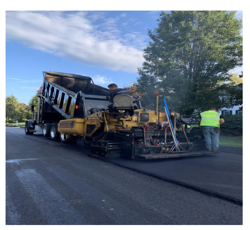
Paving top course