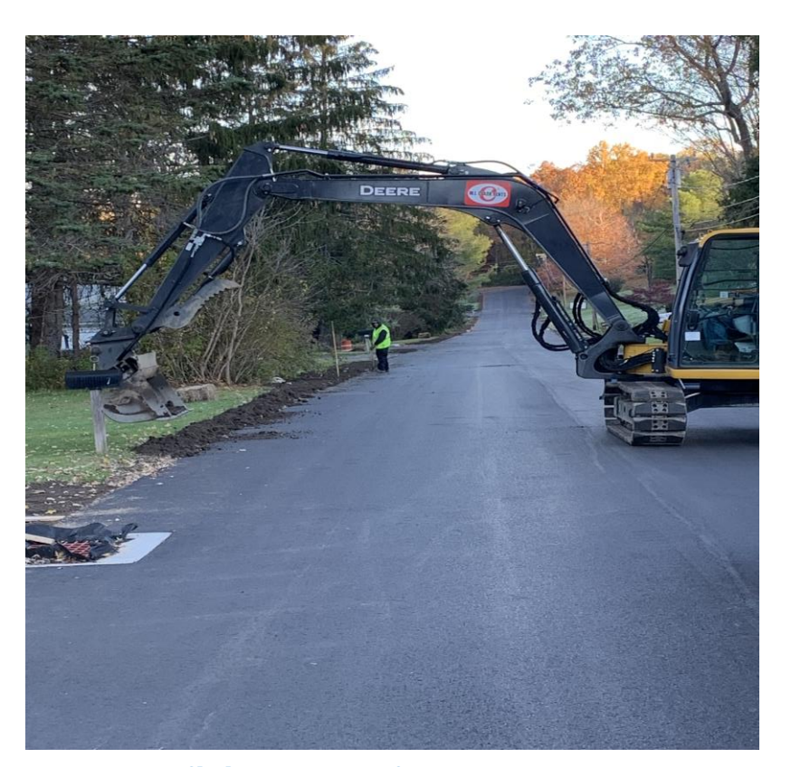
Backfilling edge of newly paved road