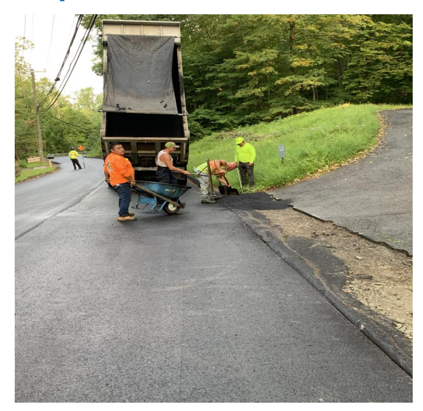
Replacing driveway aprons