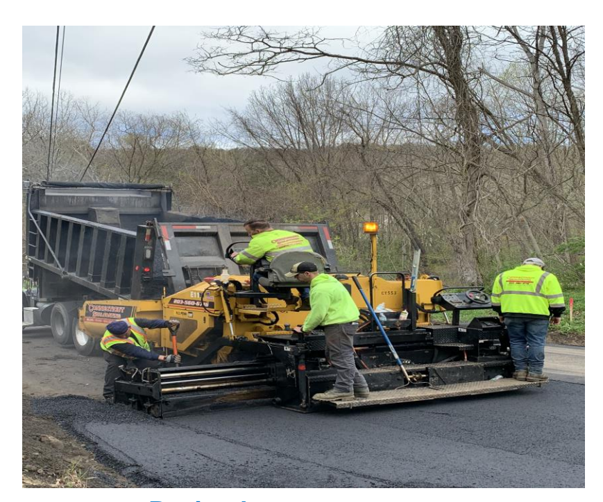
Paving base course